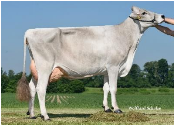
LIESE (HUVI) - HÖRMANN