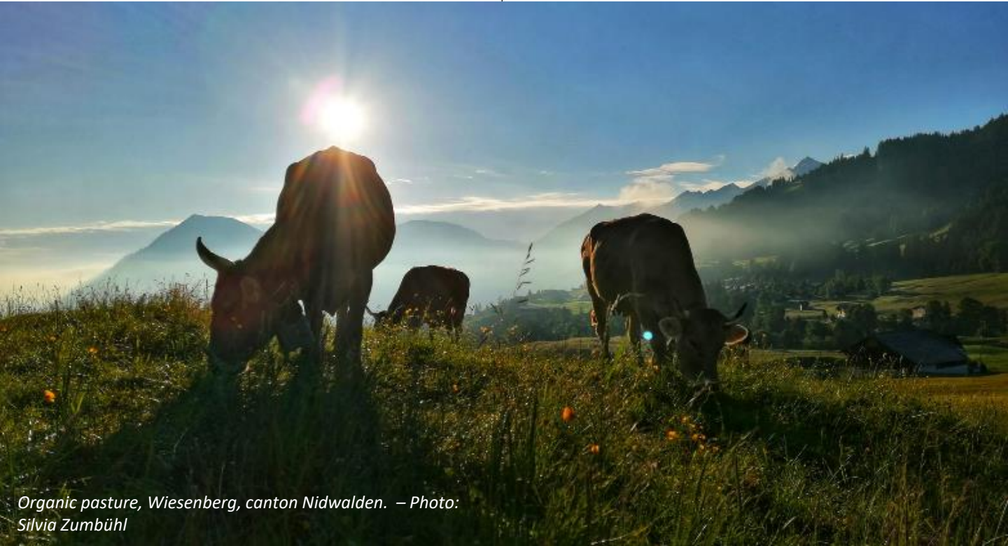
Organic pasture, Wiesenberg, canton Nidwalden.

In 2020, 52 organic farms received the Organic Bruna Award. This is about 4% of the organic farms, 41 of which are located in the mountain area and 11 in the valley. The farms have to reach minimum or maximum values for the records of protein content, lifetime production, productive life, days open and somatic cell count.