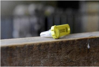
Ear tag with tissue sample

New chip SWISScow Custom 70k Array will be introduced in autumn 2020: A major advantage of the new chip is, that all individual gene tests relevant for BS and OB are included without additional cost (polled, kappa casein, beta casein A2, all genetic defects).