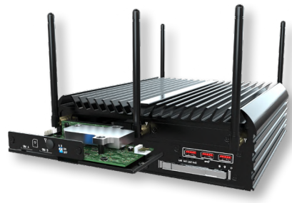
Coming Soon RCO-6000-CML SERIES