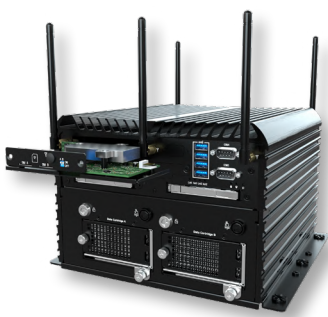
Coming Soon RCO-6000-CFL SERIES