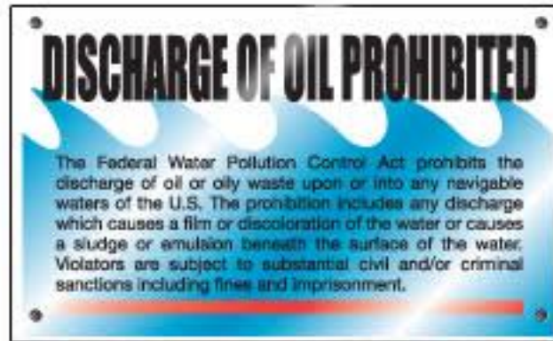
An example of a Discharge of Oil placard that must be display near the engine of boats 26' or longer.

To help bring attention to the law, boats 26' and longer are required to display a "Discharge of Oil Prohibited" placard near the engine. This placard must be at least 5"x9" in size, made of a durable material and can be found at marine supply stores.