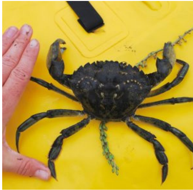
The European Green Crab is a serious threat to our native shellfish.

Many non-native plant and animals pose a serious threat to Washington’s ecology and economy. Invasives, including the European Green Crab, zebra mussels and some grasses, hitchhike on boats, trailers, fishing gear, clothing and footwear. Once these invaders become established in their new environment where their natural enemies don’t exist, they can spread quickly and outcompete the native species for food and habitat.