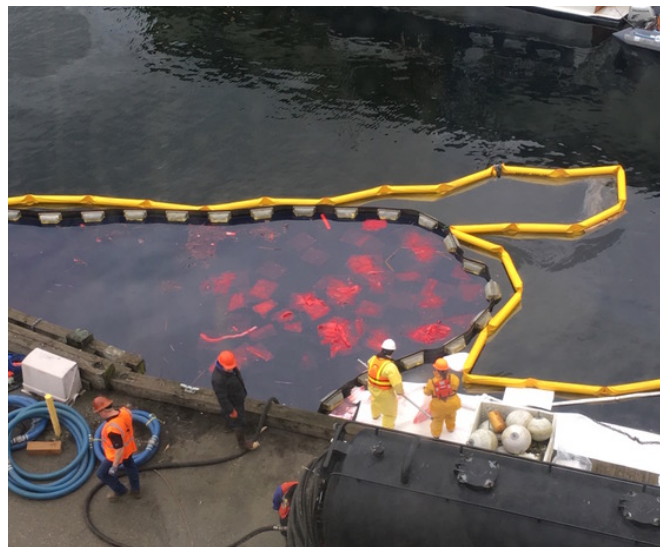
Specialists busy at work cleaning an oil spill.